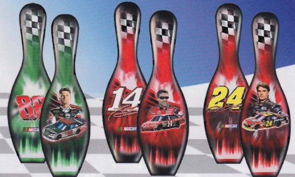
DALE EARNHARDT, JR.

The 2010 NASCAR Driver Victory Lane Bowling Pin Collection features the exclusive fully designed bowling pin. The pin is regulation-size and is decorated with vibrant NASCAR graphics on all sides. Choose your favorite from Dale Earnhardt, Jr., Jeff Gordon, Tony Stewart, Jimmie Johnson, Kyle Busch, Denny Hamlin, Joey Logano, Dale Earnhardt, Sr. and NASCAR Racing.