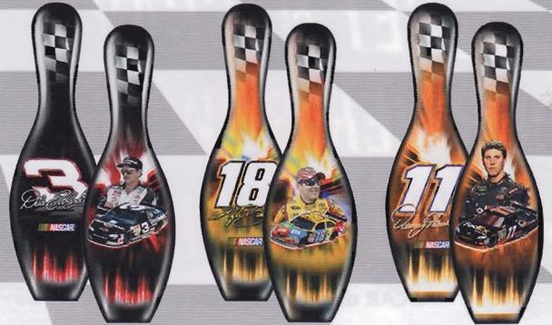
DALE EARNHARDT, SR.