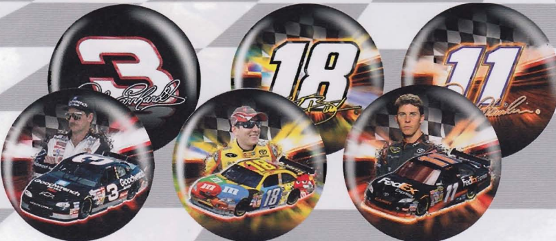
DALE EARNHARDT, SR.